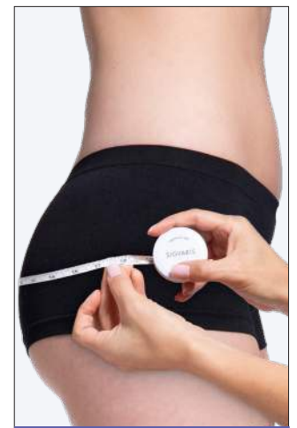
6. Widest circumference of the hip