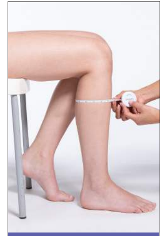
2. Calf circumference at fullest part of the calf