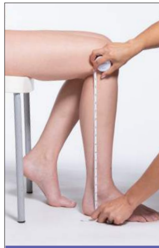
3. Calf length from the floor to the fibular head